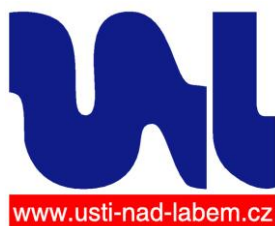
HEAD REGIONAL CITY