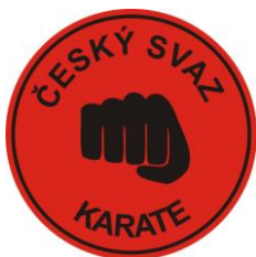
CZECH KARATE FEDERATION