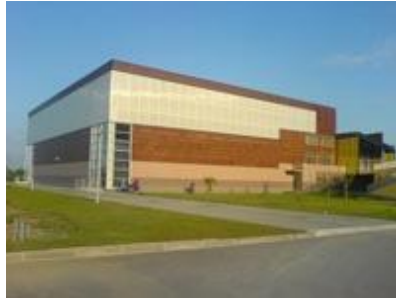
Gradska sportska dvorana City Sport Hall