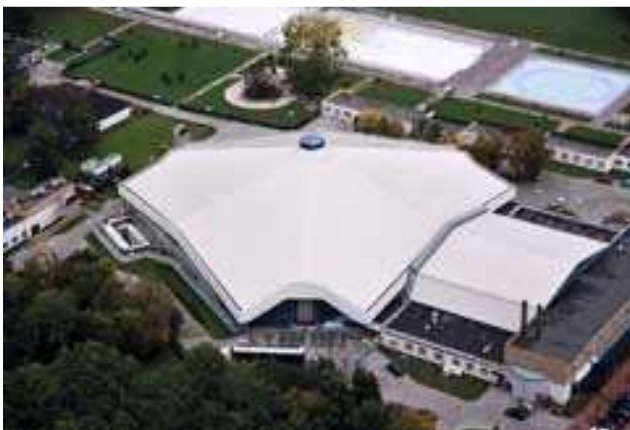
“Orbita” Sport Complex

“Orbita” Hall (2 Wejherowska street, Wrocław) – one of the most modern sport venues in Poland has been chosen for the competition. It consists of two halls; the bigger one has 3000 places for audience, 1800 square meters of surface. Sport venue has locker rooms, sanitation facilities for audience, rooms for staff with sanitation facilities, offices for organizers and staff, press office etc. All the equipment and construction aspects follow the international requirements.