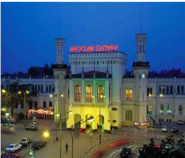
Main Railway Station

During the delegations arrivals transportation from Wrocław airport and from the main railway and bus station to the main accommodation venue will be organised according to the received travel schedules. Transportation during departures days also will be organised (from the main accommodation venue to the Wrocław airport, the railway and bus station).